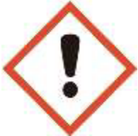
Chronic Health Hazards