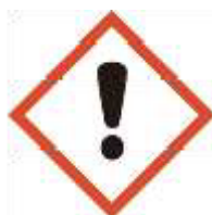
Acute Health Hazards

Eye Irritation – Category 2B Label Elements: